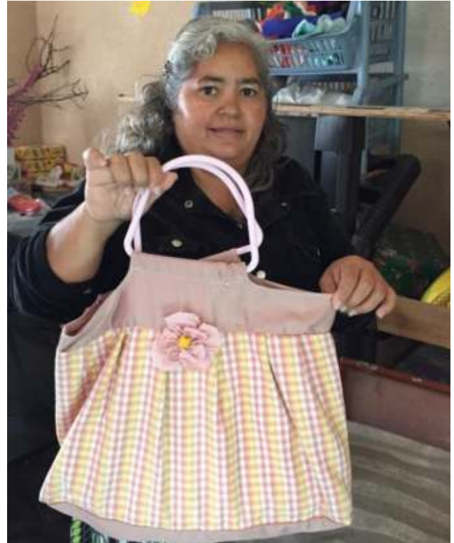
Sewing classes at San Mateo and Lirio de Los Valle.