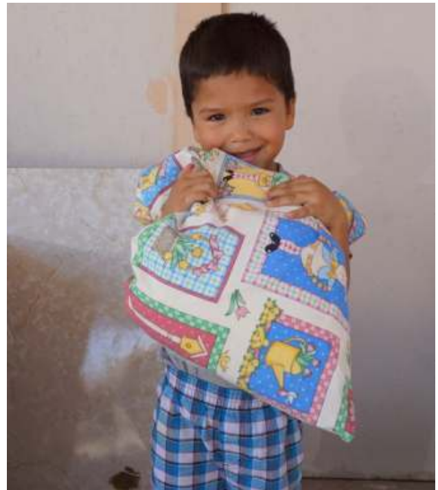
Preparing for winter! A boy from Terrazas with a new blanket.

In the next months, we will be collecting quilts, blankets and socks for wintertime.