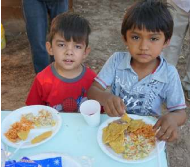
Children enjoying breakfast at Mesa Rica. Breakfast is being served in 3 other places, too.