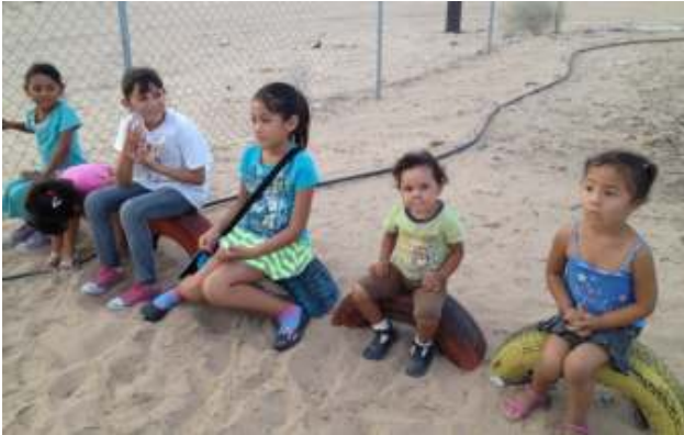
Children in El Fronterizo enjoying an outdoor Bible class during a hot summer day while the adults are studying the Word of God.