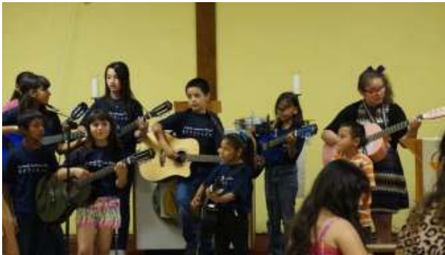
Music classes at San Mateo (St Matthew) and Lirio de Los Valle (Lily of the Valley).