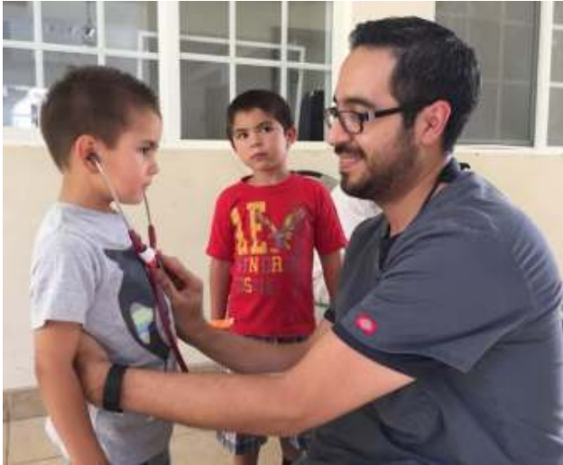
A Concordia University (Irvine, California) nursing student = friends at heart.