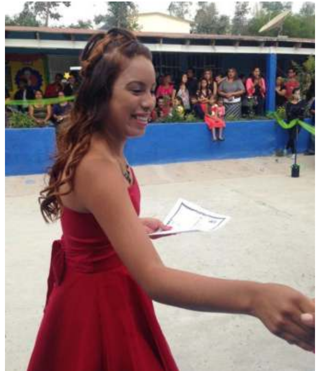
Graduation Time! A girl from an orphanage celebrating her graduation from middle school.