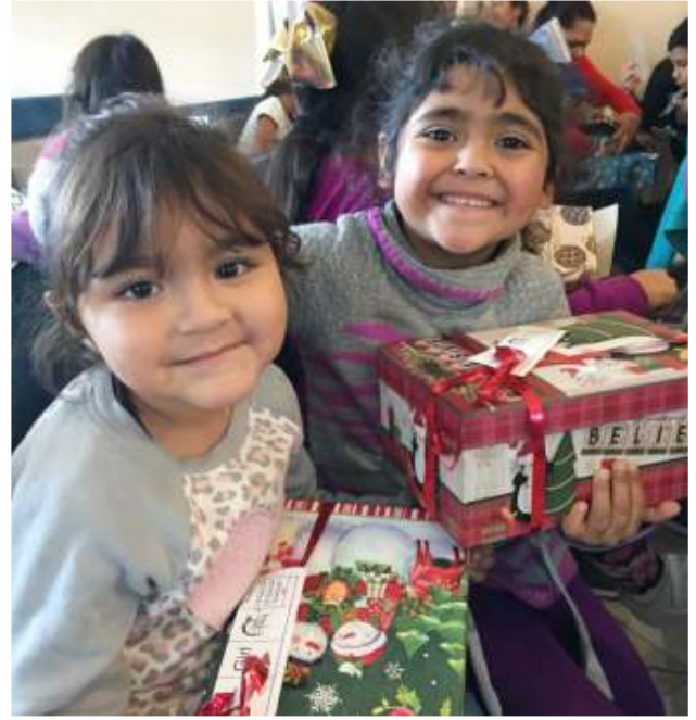
These little girls loved their shoebox gifts!

came and distributed gifts in two different places in Tijuana. Those gifts in a shoebox are like the blessings we receive in Jesus Christ that makes our lives happy and filled with excitement to keep living in Christ to serve those in need.